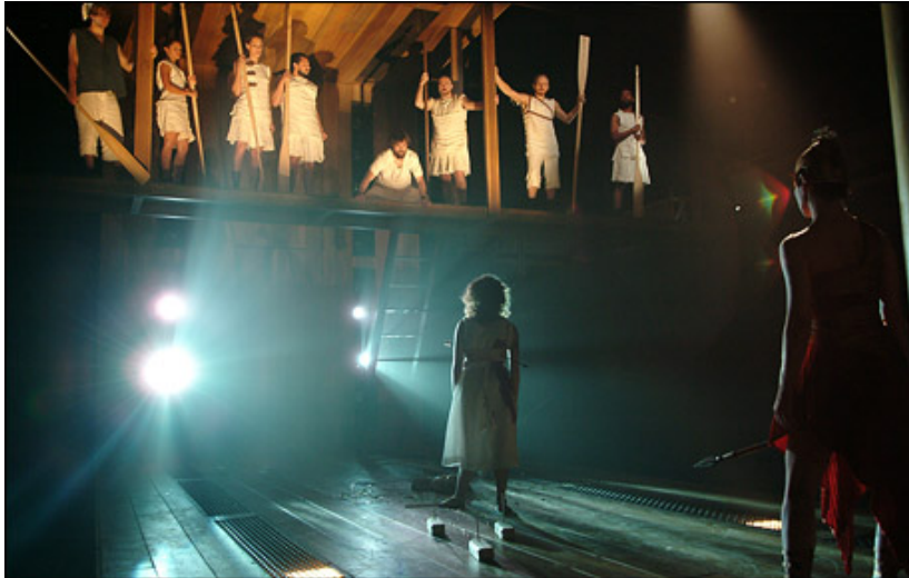
Mary Zimmerman's Argonautika makes its West Coast premiere.

Tickets to Argonautika at Berkeley Rep's Roda Theatre, 2015 Addison Street in downtown Berkeley, are available by calling (510) 647-2949, toll-free at (888) 4-BRT Tix or online at berkeleyrep.org .